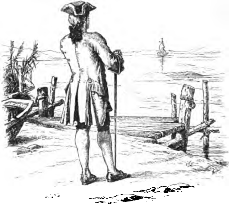
'Where Harry stood motionless.'

He hid, and wandered up and down, till near dinner-time. At last, O'Shane's boat was seen returning—but no white